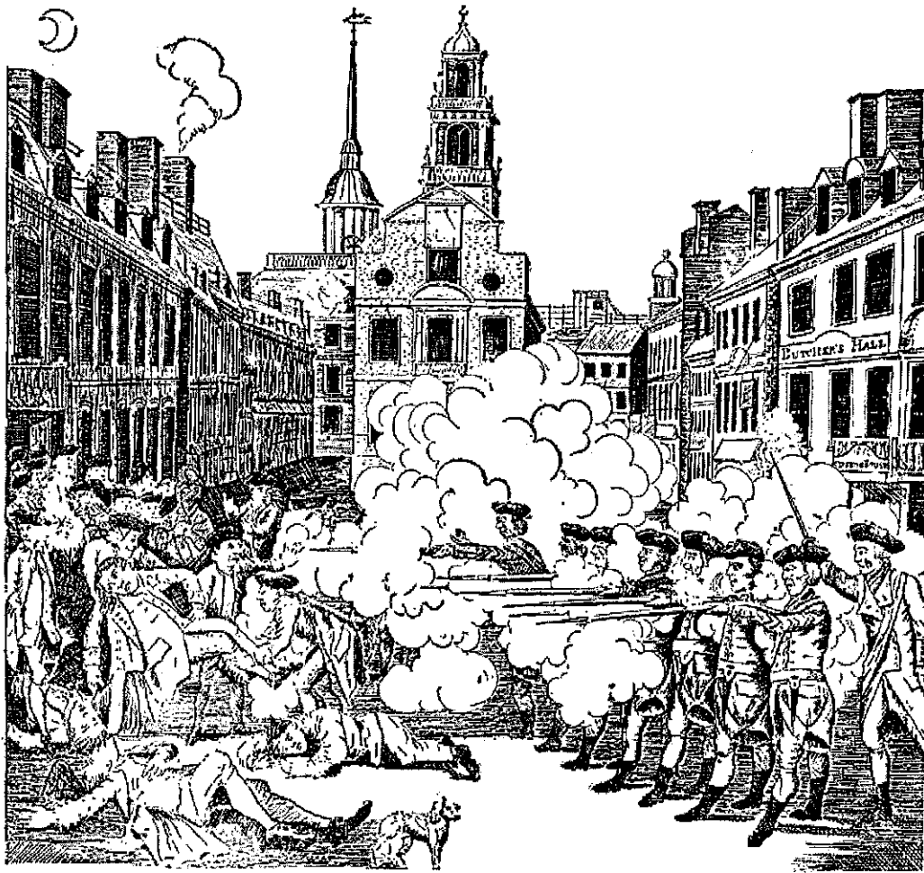
The Bloody Massacre - Paul Revere