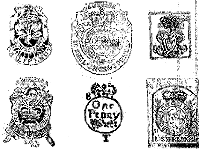
Stamps affixed to paper products under the Stamp Act.

1. What kinds of products were taxed under this act? (1 pt)